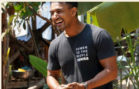
2021 Young Alumnus of the Year