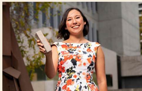
MCI takes out win in #COP26