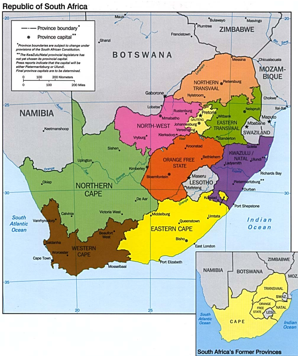
Figure 2 Provinces after 1994