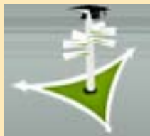
Canberra Careers Market

Date: Tuesday 5 August Time: 9:00am-2:30pm Venue: AIS Indoor Stadium