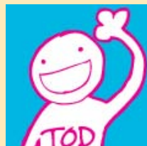
Canberra Tertiary Open Day (TOD)

Date: Saturday 30 August Time: 9:00am- 4:00pm Venue: Presentations - MCC; Information Booths - Sports Hall More Information: http://info.anu.edu.au/studyat/_Student_Recruitment/_openday.asp