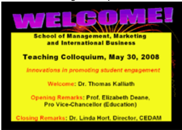
Teaching Colloquium Welcome