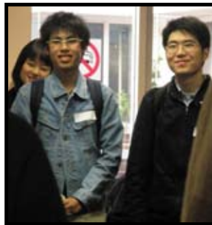
Students excited and happy to be at the ANU.

The College welcomed its newest students on Thursday 17 July at the College's biannual International Student Welcome. The Semester 2 cohort is always smaller than Semester 1, with 87 new undergraduate and 44 new graduate students commencing their studies with the College in July. Availability of on-campus accommodation proved to be a concern for this Semester 2 intake, however, it is expected that this problem will be somewhat resolved by the opening of Uni Lodge 2 in January 2009.