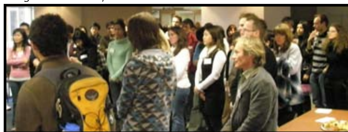
A packed room at the International Undergraduate Student Welcome.