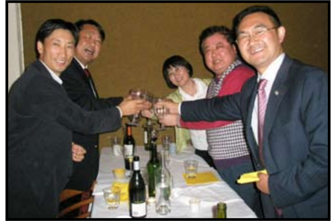
Cheers to our newest graduates.