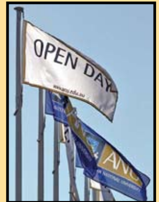
ANU Open Day Flags.

ANU will be holding its annual Open Day on Saturday 30 August from 9:00am-4:00pm. The College's information desks will again be located in the Sport and Recreation Centre [19]. In coming weeks, the Marketing and Development Office will be contacting School Administrators and Heads of School to assist in coordinating volunteers to assist at Open Day. It is expected that the reward for participating at Open Day will be the same as last year – 2 movie passes.