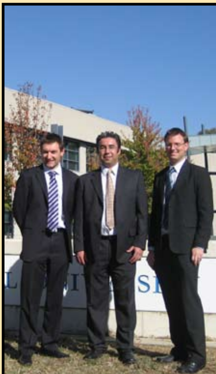
Achieving a rare distinction of becoming the winners in a global competition for the first time in ANU.