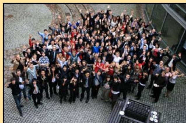
Participants of Peak Time 2008, Riga, Latvia