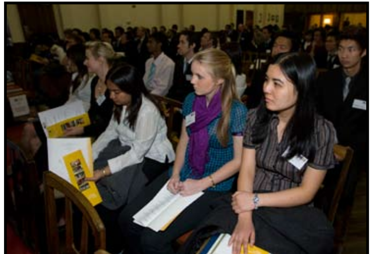
Prize & Scholarship Recipients at University House