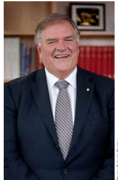
Chancellor Kim Beazley AC

A number of implementation issues surrounding this exciting and important initiative are to be discussed at the next College Executive meeting on Wednesday 12 August.