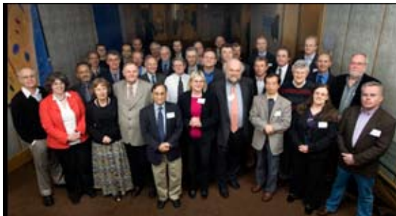
Members of CAMA at the conference